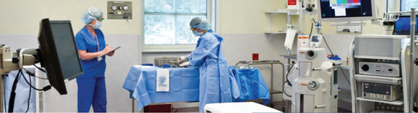
Day Kimball hospital operating room – in the Brousseau Surgical Suite.